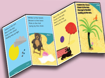
ORIGO POSTER BOOKS