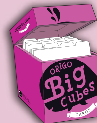
ORIGO BIG CUBES and CARDS

The ORIGO Early Learning resources support the Early Years Framework by providing stories and activities for achieving Outcome 2 , Outcome 4 , and Outcome 5 .